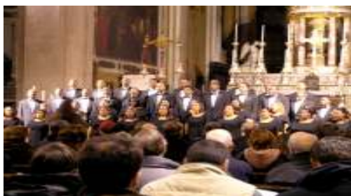
Performance at St. Eustachio Church Rome

The 2006 UAPB Concert Choir completed their first International Tour of Rome Italy during Spring break March 13-19, 2006. The choir toured: the Roman Forum, the Spanish Steps, the Colosseum, the Pantheon, St. Peter's Basilica, The Vatican Museum and the Sistine Chapel. They also visited the Duomo, the Palazzo Publica, Florence and Venice. They toured main island of San Marco and St. Mark's Square, the Basilica of St. Mark and Milan. The choir sang a variety of music, classical, a-cappella, chorales, etc, but the audiences in Italy seemed to respond most to the Negro spirituals. The choir was publicly complimented by the officials in charge of the mass and was invited to take pictures at the front of the church after the mass. The choir was outstanding ambassadors for the university. Here are a few pictures taken and shared by our Alumnus Willie Everett.