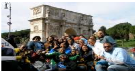
UAPB Choir at Roman Colosseum

UAPB concert Choir preformed in Rome Italy and all of the performances were superb. The audience responses were fantastic.