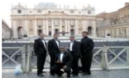
Outside the Vatican