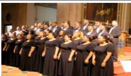
Performance at St. Eustachio Church Rome